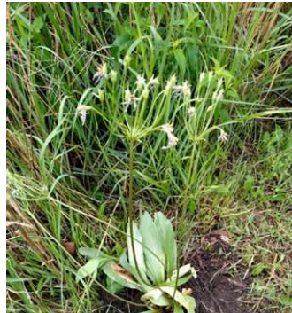
Shooting Star transplanted at the ABC from remnant prairie in Foxconn's path