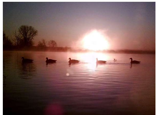
Geese at sunrise