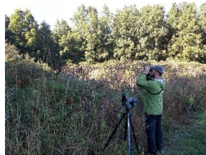
Aaron birding on the path at the edge of the woods

We recognized some of the many volunteers this November using Facebook and the www.adamconservancy.com site. Please Like us on Facebook or check the website in the Latest News tab for more details.