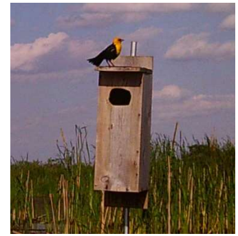
A yellow-headed blackbird seen from the first wildlife blind.