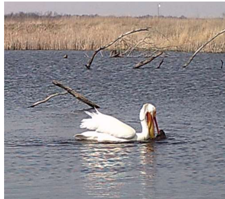
Pelican in the west dike pond.