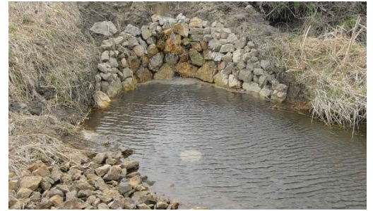
Bubbling Springs with Small Falls