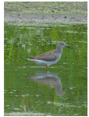
Lesser Yellowlegs Reflects