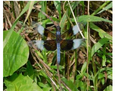
Widow Skimmer Dragonfly

Thanks for your interest and for the help and support you provide to the ABC. Stay in touch!