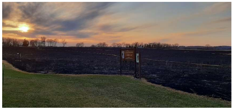
Post-Burn from Main Sign [L Hying]