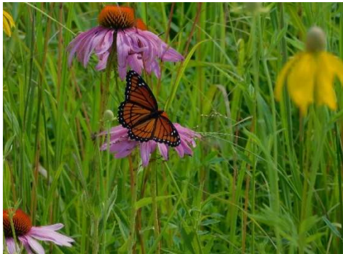
Viceroy on Purple Coneflower