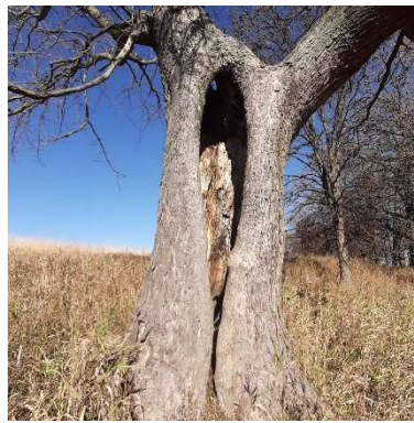
Treebeard – Lord of the tree Rings