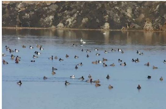
March = Waterfowl Watching