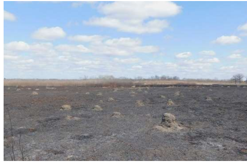
Formica Ant Mounds Post-Burn