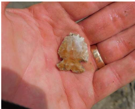
6-8,000 BCE Native Hafted Scraper